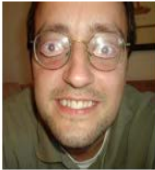
Trifocals for an adult