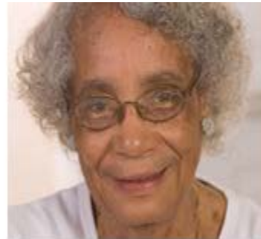
Elderly woman's prescription