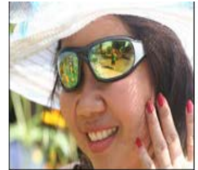
Young adult wearing sunglasses