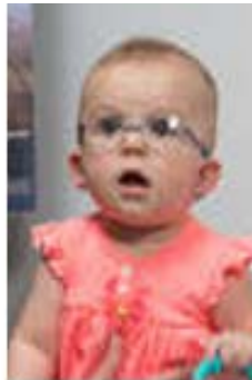
Bifocals for a baby